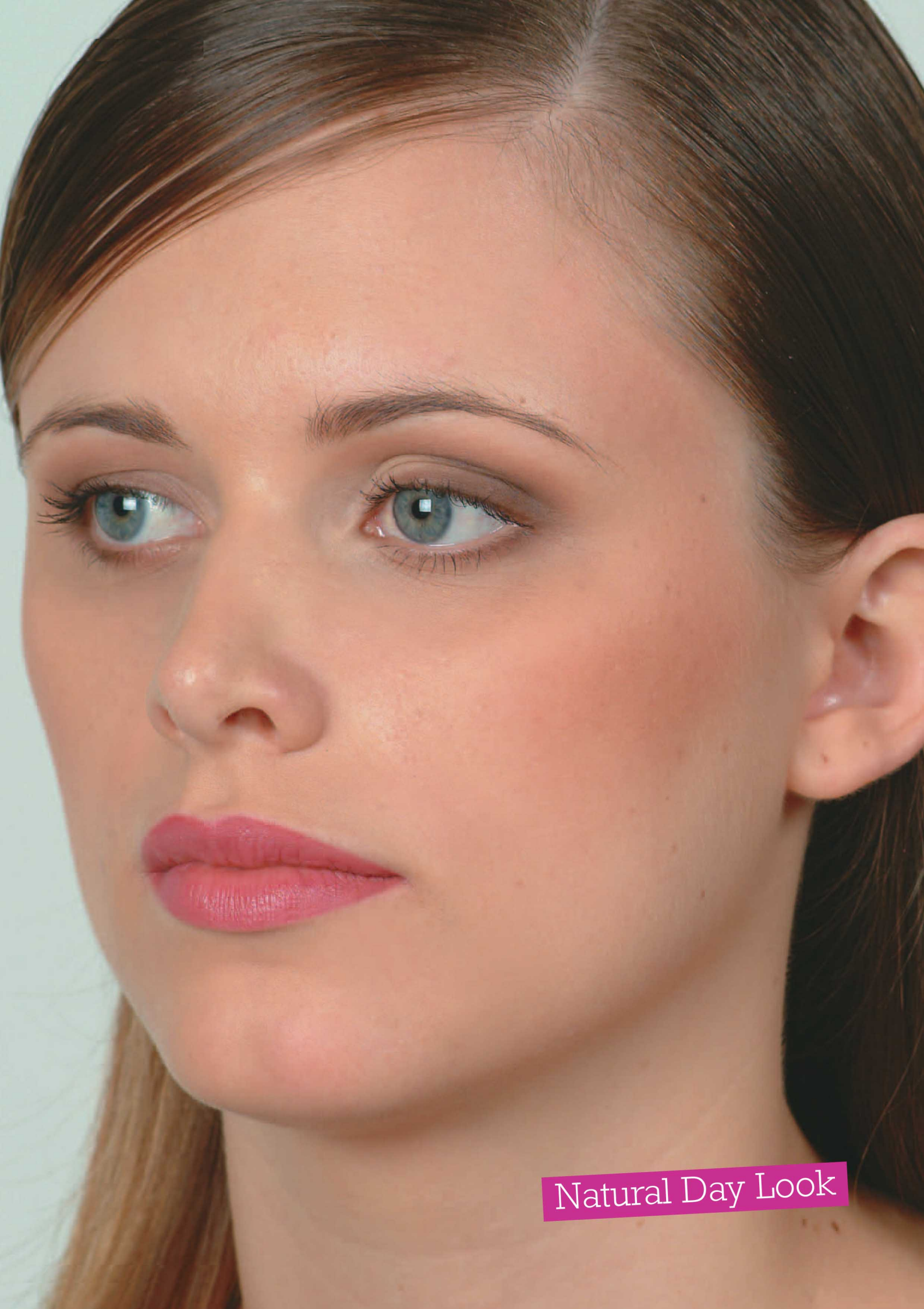
Natural Day Look