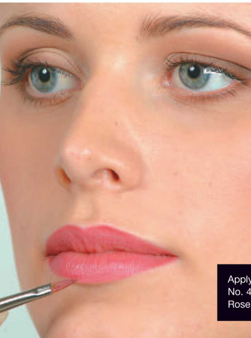
Applying Lipset No. 46 in Rose Drop